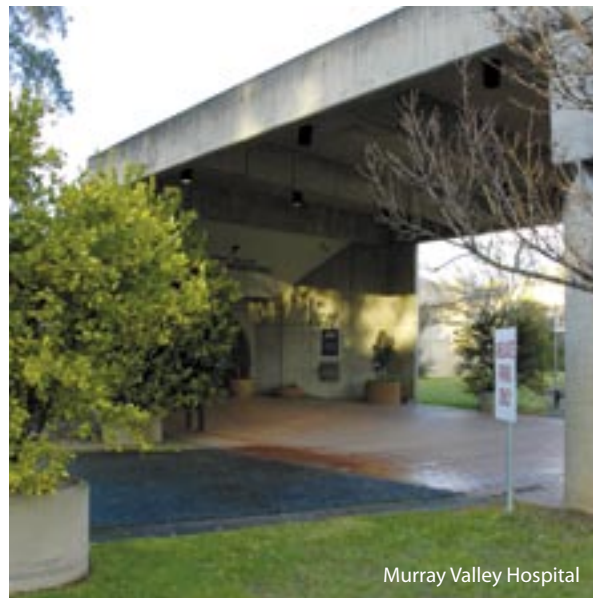
Murray Valley Hospital